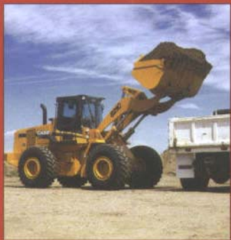
LIFTING EQUIPMENT p.20

تخدم صناعات البناء ومعدات الإنشاءات والطرق وتوليد الطاقة في الشرق الأوسط وشمال أفريقيا منذ ١٩٨٣ Serving the Building, Construction Machinery, Road & Power Generation Industries in the Middle East & North Africa since 1983