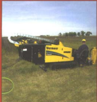
TRENCHLESS TECHNOLOGY p.32