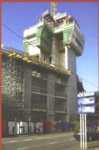
CONSTRUCTION IN THE BENELUX p.39